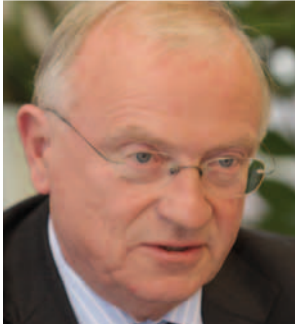
Luc VAN DEN BRANDE – BE

Special adviser to Regional Policy Commissioner Johannes Hahn for multilevel governance issues in cohesion policy and the EU2020 Strategy, President of the Jury.